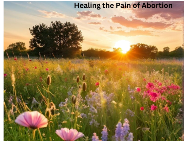
Healing the Pain of Abortion