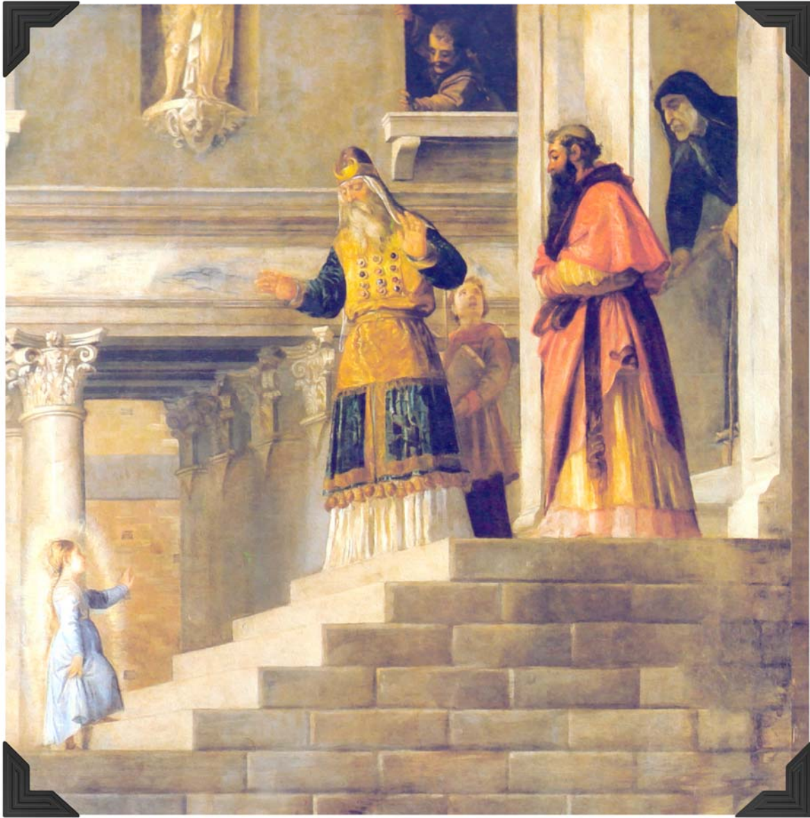
Nativity of Our Lord Monroe Township, New Jersey