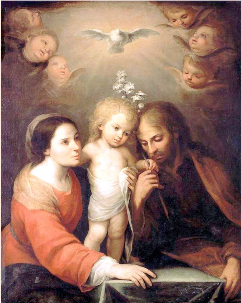
Nativity of Our Lord Monroe Township, New Jersey